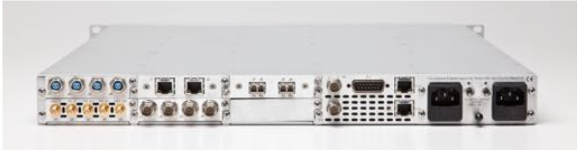
Typical 1U Chassis Rear View