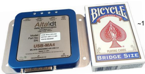
Very Small ~110x89x17mm

O-Scope A/D Signal Capture Included on First Channel of 1553 and First 2 Channels of ARINC