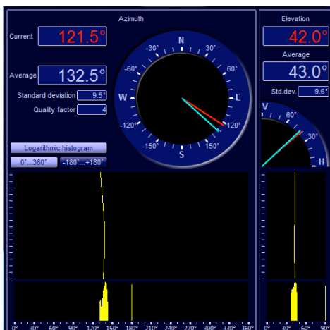
Example showing azimuth and elevation of sky wave on HF band

There is also an integrated digital recorder, making it possible to instantly record and playback the received signal, both at the IF and audio levels, for all three receiver channels.