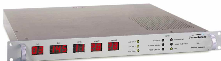
TSC TCT Time Code Translator

The TCT displays the time and its internal status on the front panel. The status includes loss of signal, time-code CRC error, internal error, resynchronization of the internal time base, PLL out of lock, VCXO control voltage near end of range, leap year, and leap second occurring today. In addition, the TCT produces an optical 1PPS, which may optionally be monitored by the upstream equipment. This 1 PPS is suppressed when there is a TCT failure, and transmits the failure event to the upstream equipment. The returned 1PPS may also be used to monitor the performance of the TCT. Transmission of detailed status information, in addition to the return PPS, is an optional feature.