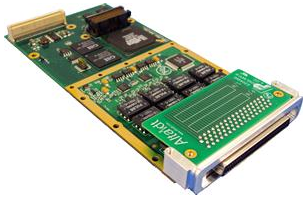
SCSI to Flying Lead Cable Provided