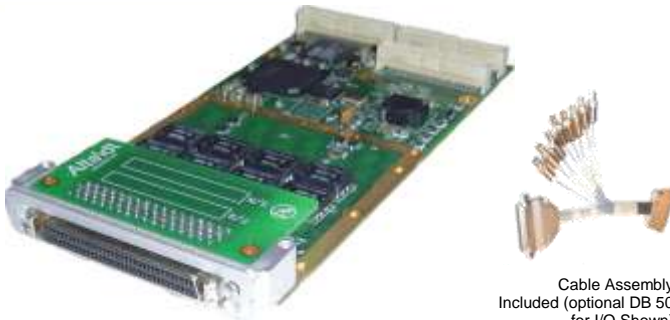
Cable Assembly Included (optional DB 50 for I/O Shown)

Alta Data Technologies' PMC-1553 interface modules (PCI Mezzanine Card for Carriers and Single Board Computers) are multi-channel (1-4) 1553 cards supported by the latest software technologies. These PMC cards are based on the industry's most advanced 32-bit 1553 FPGA protocol engine, AltaCore™ , and by a feature-rich application programming interface, AltaAPI™ , which is a multi-layer ANSI C and Windows .NET (MSVS 2005/08/10 C++, C#, VB .NET) architecture. This hardware and software package provides increased system performance and reduces integration time.