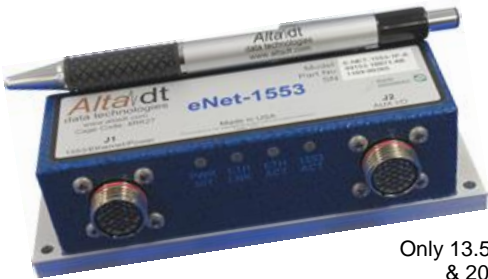
Only 13.5 x 3.7 x 4 cm & 200 grams Small, Rugged Appliance